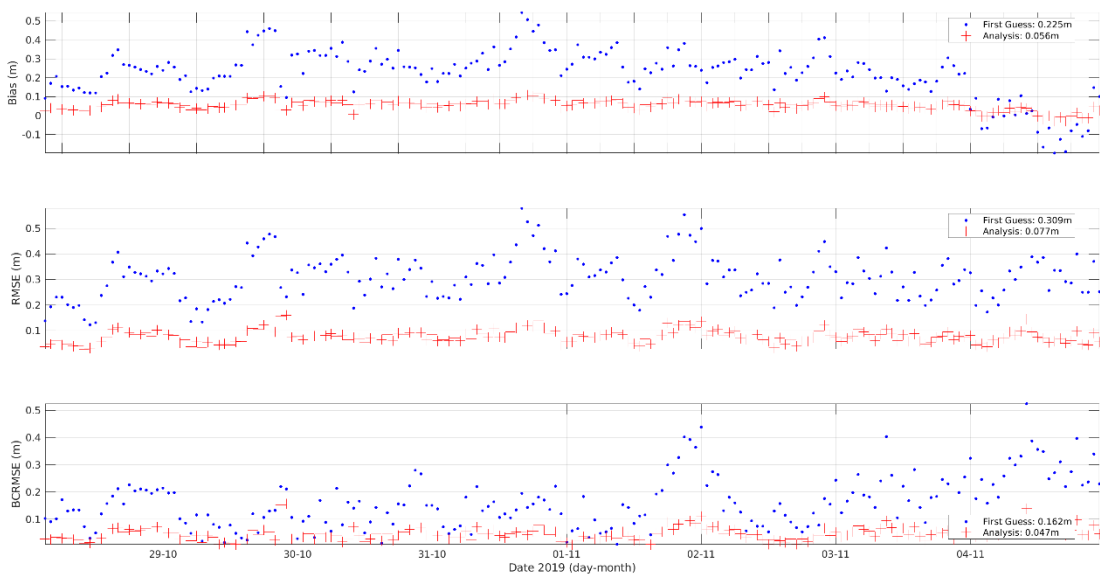
Figure 2. Time series of bias, RMSE, and bias-corrected RMSE (BCRMSE), for the first guess (blue) and the analysis (red) at Guam.

The spatial resolution of all the analysis parameters for the PR domain will be doubled, from 2.5km to 1.25km. This upgrade does not have a statistically significant impact on the accuracy of the SWH analysis. Also, the option for assimilating observations from altimeters is activated; this upgrade has a limited effect on the analysis due to the satellite repeat cycle and the limited size of the domain.